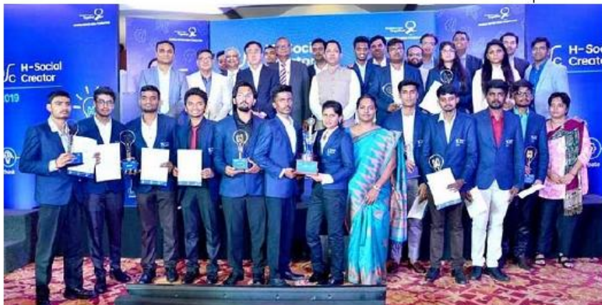
The winners of 'H-Social Creator' awards

Published: 26th November 2019 12:16 PM | Last Updated: 26th November 2019 12:16 PM