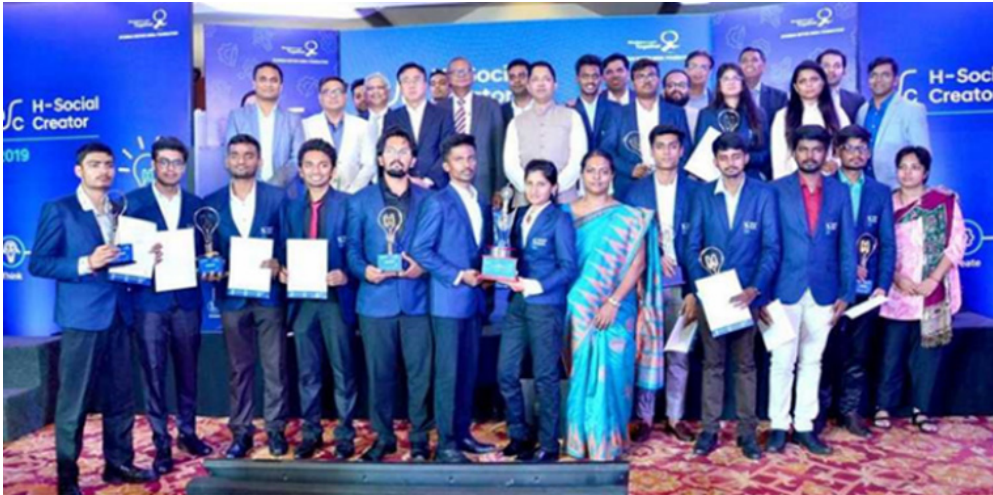
The winners with the trophy along with finalists and the esteemed jury